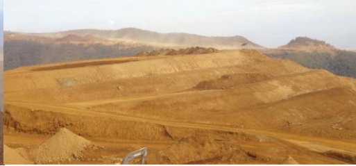
AFTER RE-SHAPING, 2015