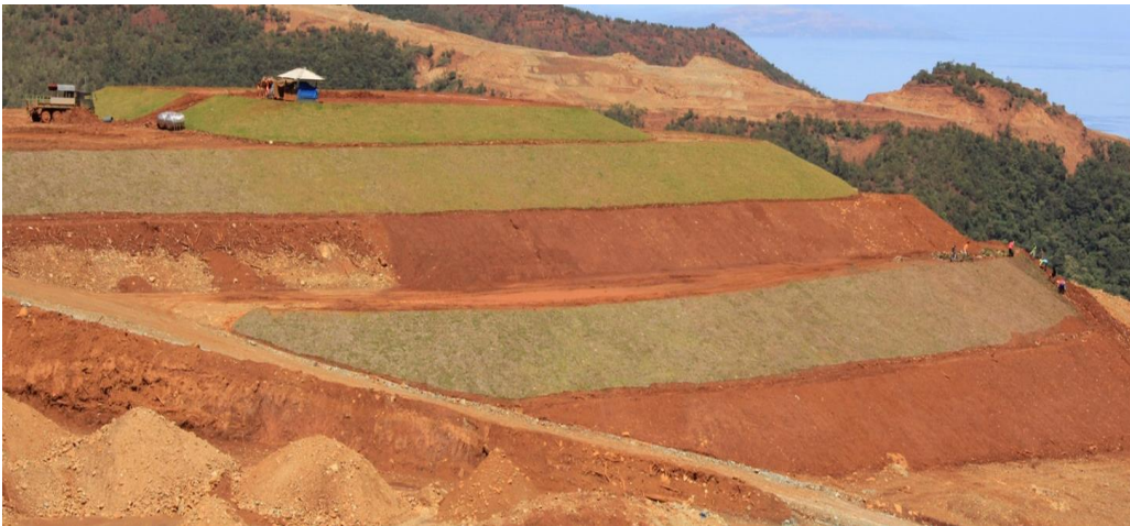
TO DATE, 2016